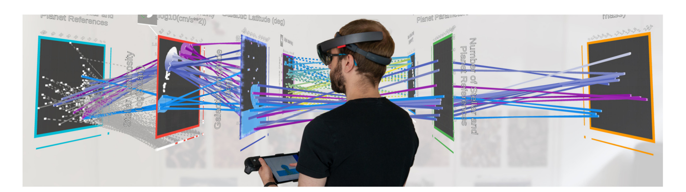
Figure 1: STREAM combines spatially-aware tablets with augmented reality head-mounted displays for visual data analysis. Users can interact with 3D visualizations through a multimodal interaction concept, allowing for fluid interaction with the visualizations. [9].

STREAM addresses the loss of context when switching between AR and tablet visualization (C1) by providing a seamless transition interaction, thus reducing mental demand by merging both the tablet and AR visualization. However, due to the co-dependency between both de-