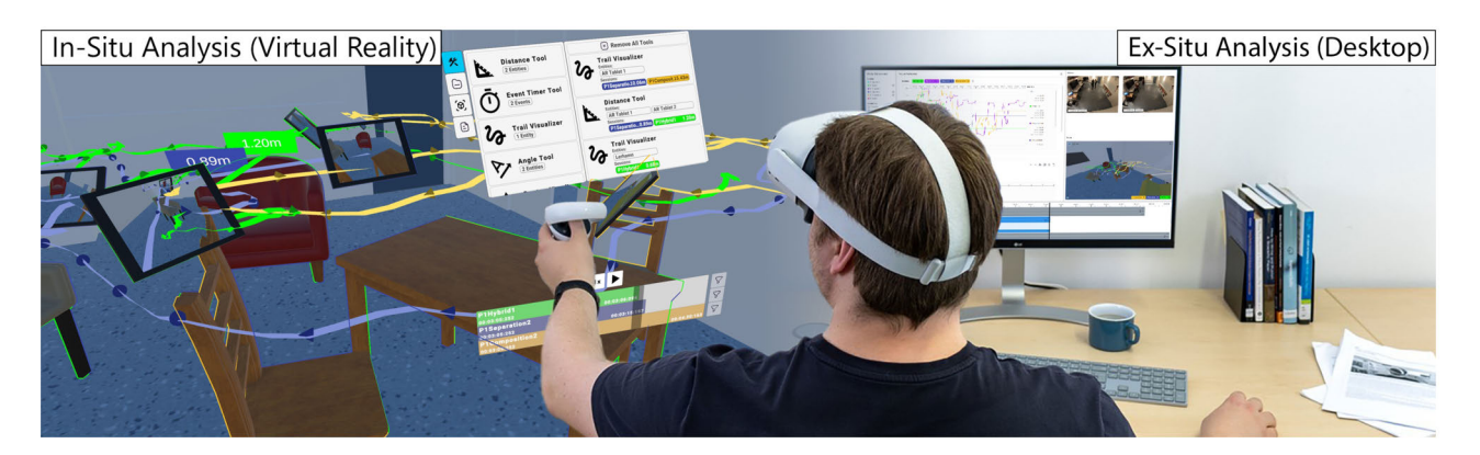
Figure 2: The ReLive mixed-immersion tool combines an immersive analytics virtual reality view (left) with a synchronized non-immersive visual analytics desktop view (right) for analyzing mixed reality studies. The virtual reality view allows users to relive and analyze prior studies in-situ, while the desktop facilitates an ex-situ analysis of aggregated data. [8].

In this work [26], we studied collaborative sensemaking activities using personal tablets and a shared tabletop. Here, we combined two homogeneous devices for complementary collaborative sensemaking activities (see Figure 3). The tablets act as private space, where each user can search, read, and annotate documents independent of their partner's activity, facilitating loosely coupled ac-